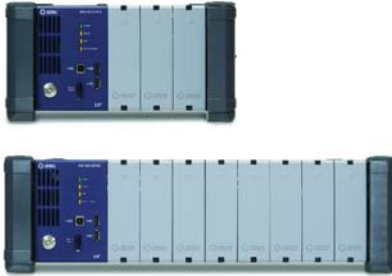
MAP-230 (top) and MAP-280 (bottom) mainframes