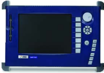
Figure 1 Keypad/display module