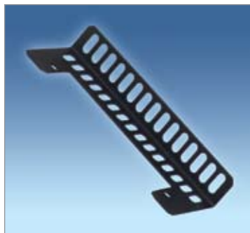
FM000948-B bracket is used to mount a single Poli-Mod to a 19" or 23" equipment rack or into limited space applications (e.g. traffic control cabinets)