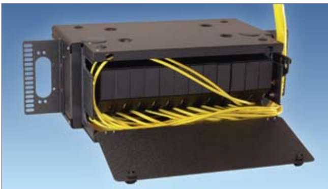
Rear view of 4RU panel with (12) Poli-MOD modules