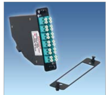
FM001636 bracket allows standard LGX modules to be mounted into existing Corning Cable Systems™ CCH series and PCH series racks and wall mount products.