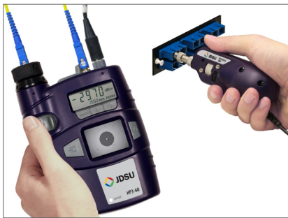
Inspect the Patch Cord with Integrated PCM and the Bulkhead with Probe