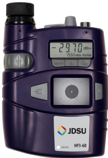
HP3-60-P4 Fiber Inspect and Test System with Integrated Patch Cord Microscope and Power Meter